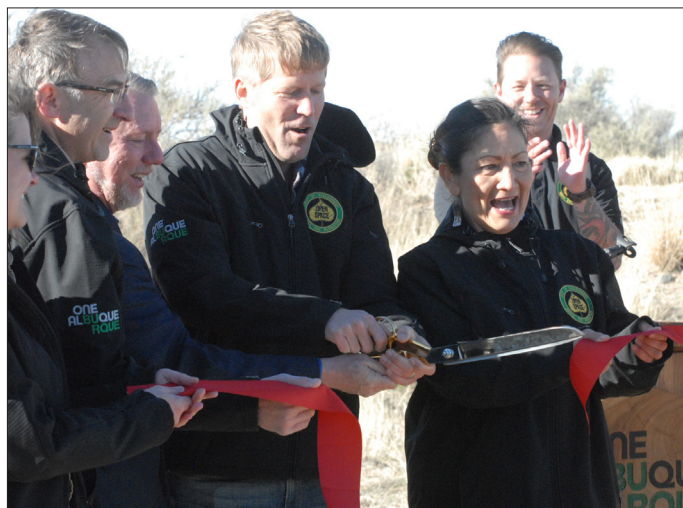
Mayor Keller cuts the ribbon to celebrate new Open Space acquisitions in the Tijeras Arroyo.

These two acquisitions increased the amount of City-protected lands within and around the Tijeras Arroyo by approximately 40 acres. In addition to their designations as priority parcels in the Bio-Zone plan, Logan Ranch Open Space (named for its historical role as part of Logan Ranch) and the Route 66 extension are also important acquisitions because of their connections to existing Open Space property within the arroyo.