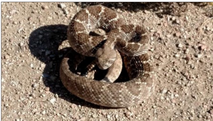
Western Diamondback, Elena Gallegos Trail 342, September 2015

Snakes have been slithering through forests, deserts, grasslands, jungles, and swamps for over 160 million years, but the Rattlesnake is a more recent critter to emerge on the snake family tree, having first rattled its tail some four million years ago. There are about 36 known species of rattlesnakes with between 65 and 70 subspecies, and they are found only in the Americas. From the southern tip of Argentina to southern Canada, and from the Eastern Seaboard to the California Channel Islands, you can hear the familiar rattle in a variety of ecosystems, but the rattlesnake is most common in the Southwestern United States and Northern Mexico.