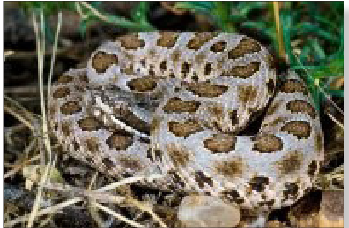
Above: Massasagua Rattlesnake

Rubio, Manny, 2010, Rattlesnakes of the United States and Canada . Eco Herpetological Publishing, Rodeo, New Mexico.