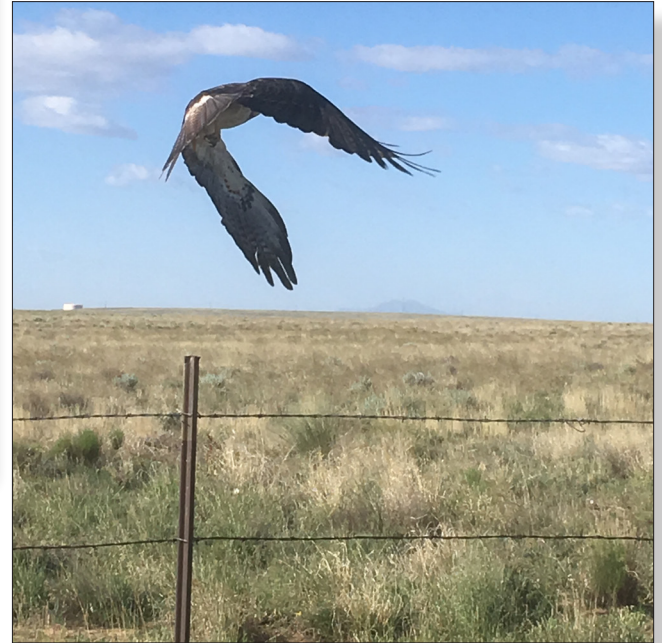
Above: One of many Swainson's Hawks that can be seen at the Open Space Shooting Range, Below: Copper Trailhead