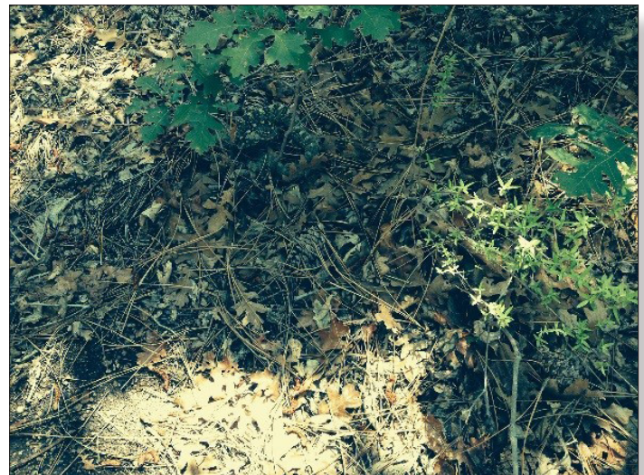
Below: Northern Black-Tailed, Domingo Baca Trail, July 2014

A few tips compiled by NPR's Patti Neighmond