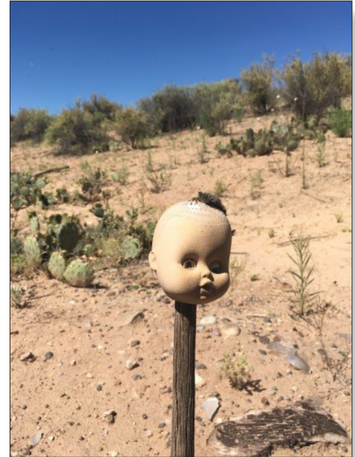
Weirdest trash winner of National River Clean-up, a creepy doll head found at Pat Baca Open Space

Thanks again to everyone who participated and thanks also to all of our sponsors on the opposite page!